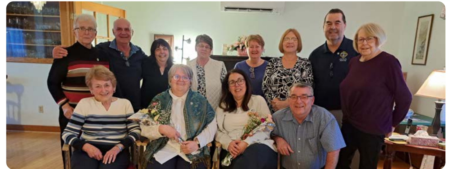
Sydney Mines reception May 25, 2025