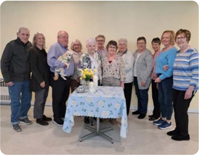
Trenton Martha Associates 2025

It was a wonderful morning, and we are hopeful our new friends will accept the invitation to journey along with our group!