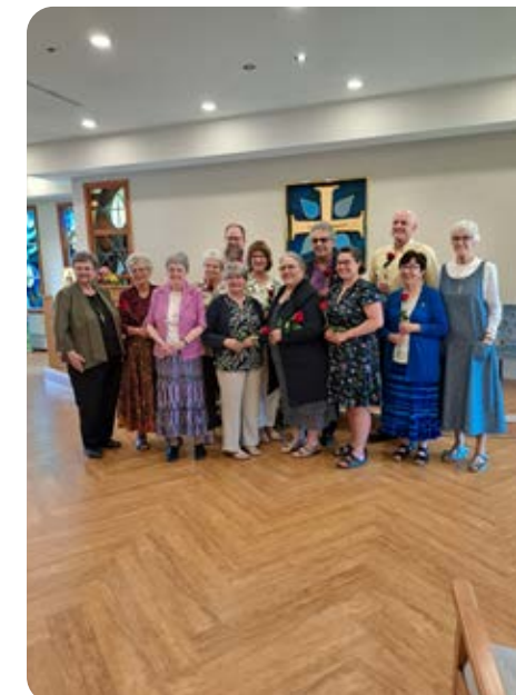
Antigonish Reception, June 15, 2025