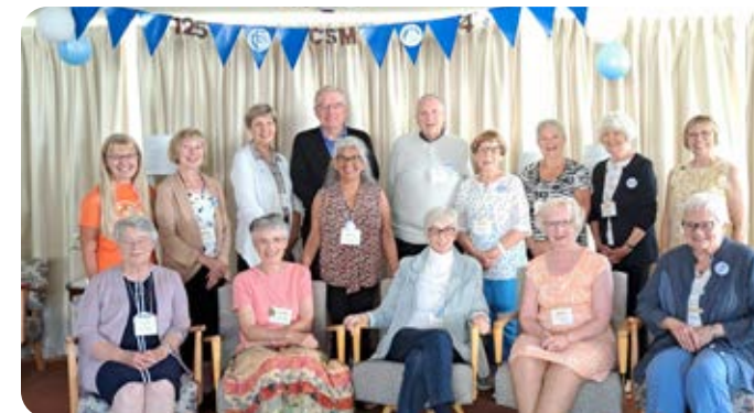
Martha Associate Retreat, Lethbridge, September 13, 2025