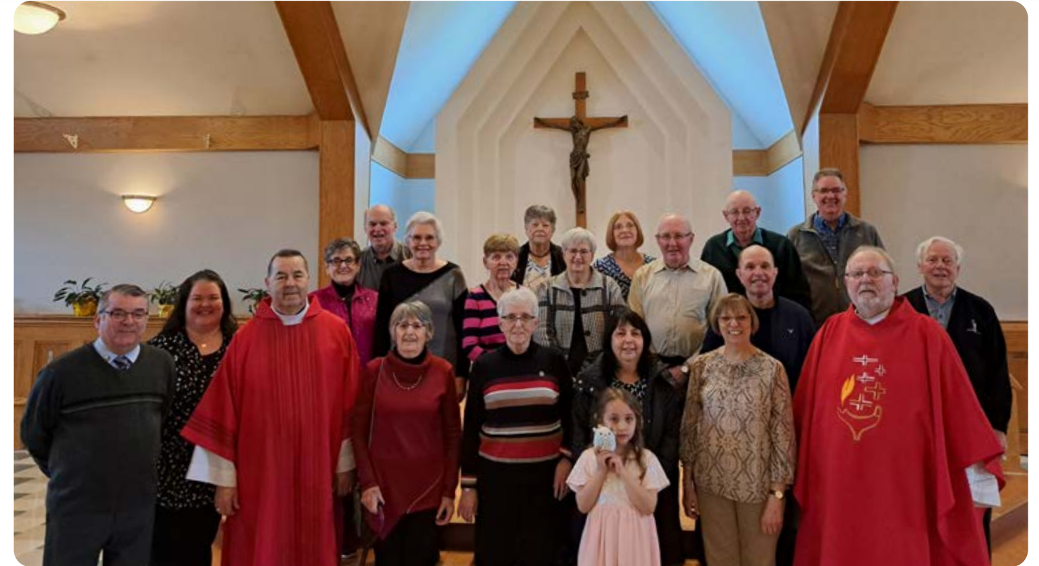
Mass For Shut Ins. April 5, 2025.