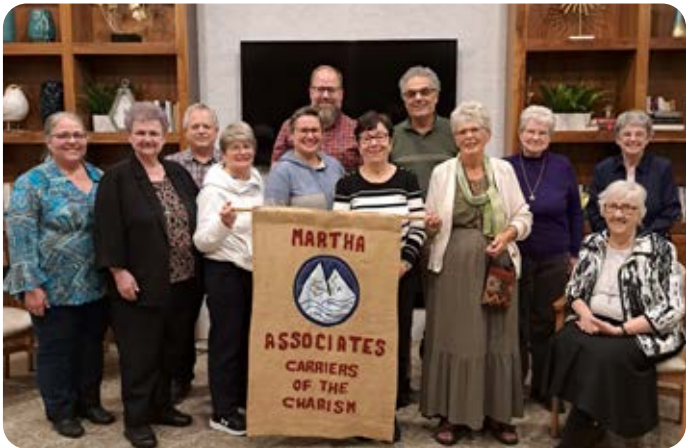
Antigonish Martha Associates

Our year began with our annual retreat in September. As we arrived at the tables where our names were, we were overjoyed to realize that our whole Associate Journey Community was present for the retreat! The title, “Rooted in our Living God, we Live our Lives as Mission” brought us through a wonderful day- listening, reflecting, sharing, meeting members of other Associate Communities helped us expand our vision of Martha Associates.