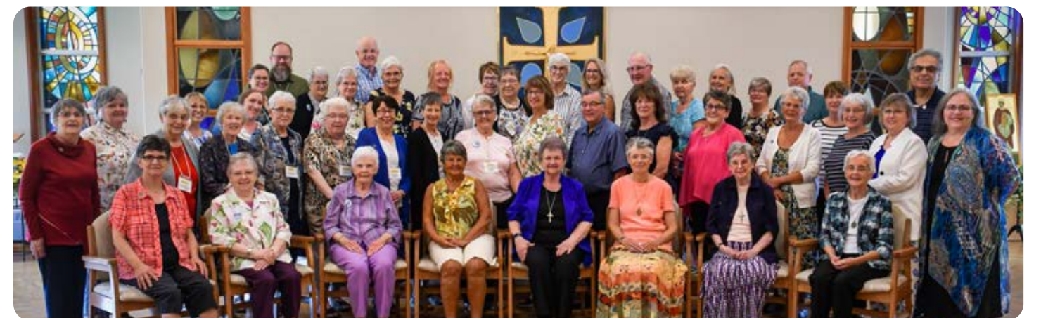
Martha Associate Retreat, September 6, 2025 Antigonish