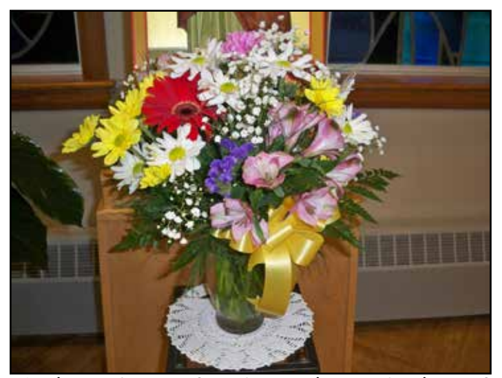
Blessings and prayers from the Associates to the Sisters of St. Martha, July 2019

This KEY of AGE and BEAUTY symbolizes the authoring of life. As the Governance Group, we will open doors to the future, as well as unlock and set free the hearts of those with whom we live and serve. We pray that this KEY will open new doors, new beginnings, new frontiers with the support of our Sisters, Associates, friends and collaborators. We know that LOVE is the MASTER KEY and will influence all our service. May we continue to reflect, like a prism, the presence of a Trinitarian God in the midst of all Creation!"