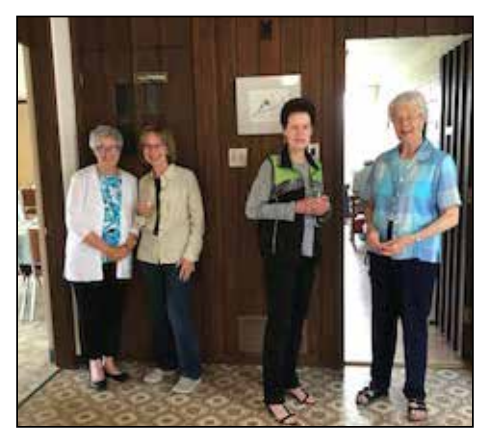
Looks like the some folks from the West were caught with fingers in the cookie Jar!!