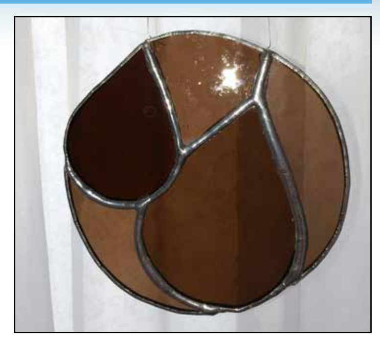
Stained glass symbol, a gift from the Sisters of St. Martha to the Associates

We are very grateful to the Leadership Council and to the Sisters of St. Martha for their beautiful and generous gift to each of us.