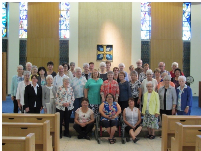
Eastern Gathering 2015

Fearlessness and inner freedom are qualities we associate with prophets.