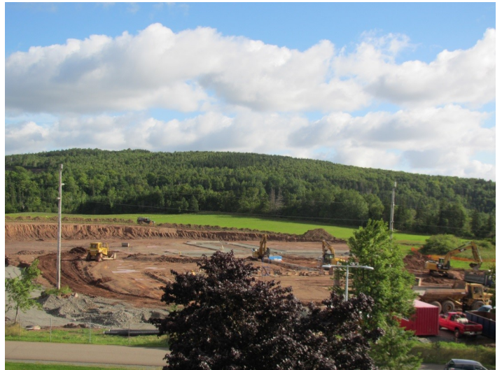
New facility under construction, August 2016

Hopefulness, as an attitude that imbues all we say and do is one of the fruits of contemplation. Among other things it is the result of a life that is steeped in gratitude and thankfulness to God.