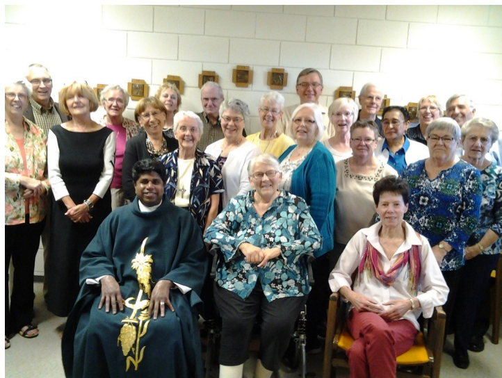
Western Gathering 2015