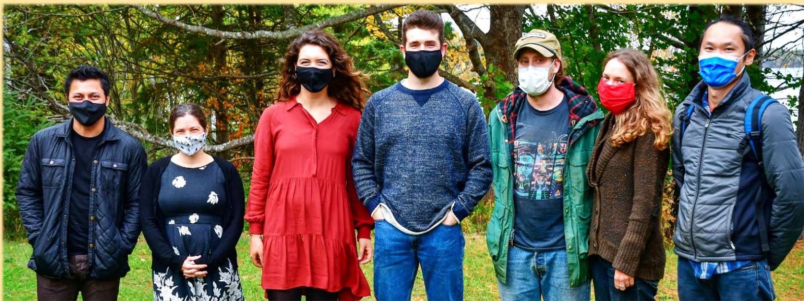
Current and former Martha New Growers Program participants had a chance to chat during the gathering.

Next summer they are hoping to grow food somewhere in the province depending on where the opportunity is.