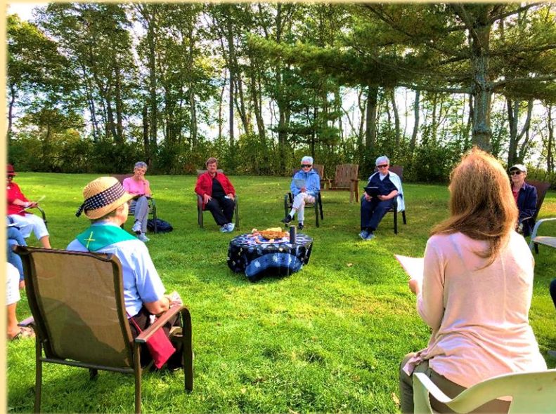
Season of Creation Gathering in St. Theresa's Garden

Due to Covid-19 restrictions, a small ecumenical group gathered on a beautiful day to share in prayer and celebration, reflecting on the beauty and gifts of the natural world. The group offered rich sharing about how we connect with the Spirit through nature and the importance of creation care. We will continue to grow in deepening our love of creation through future gatherings, networks like the Global Catholic Climate Movement, our New Growers program, and ongoing care for this land and all of creation.