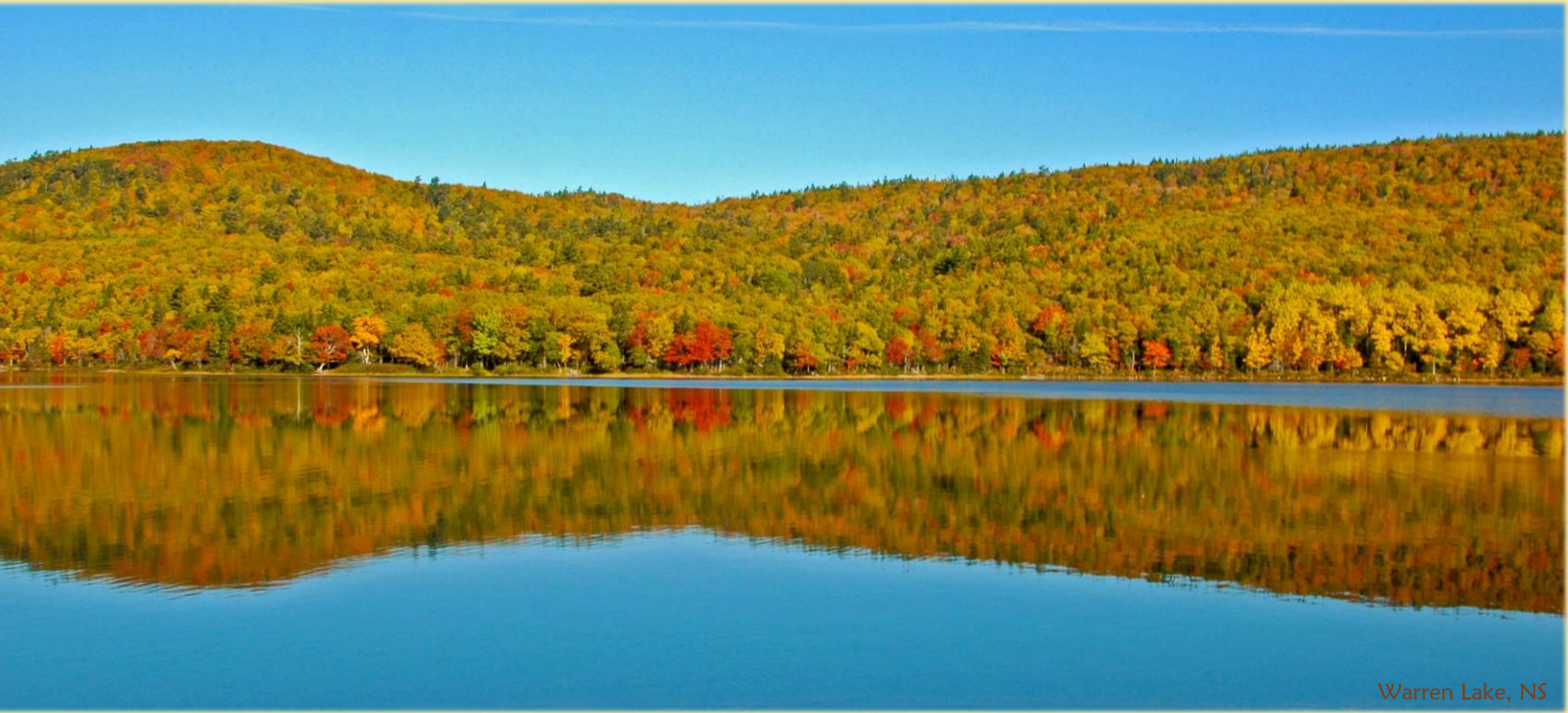
Warren Lake, NS

Have you ever been to Spain? I do not know how the season of Autumn presents itself in that beautiful country. I do know, however, how Autumn/Fall gently lands on us and makes her presence felt in Canada. I have lived in many provinces in our great land and still believe that Nova Scotia provides our souls and our senses with the richest feast of beauty!