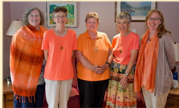
The Leadership Team and Martha Justice Ministry Coordinator