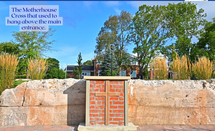
The Motherhouse Cross that used to hang above the main entrance.

Sisters of St. Martha of Antigonish www.themarthas.com