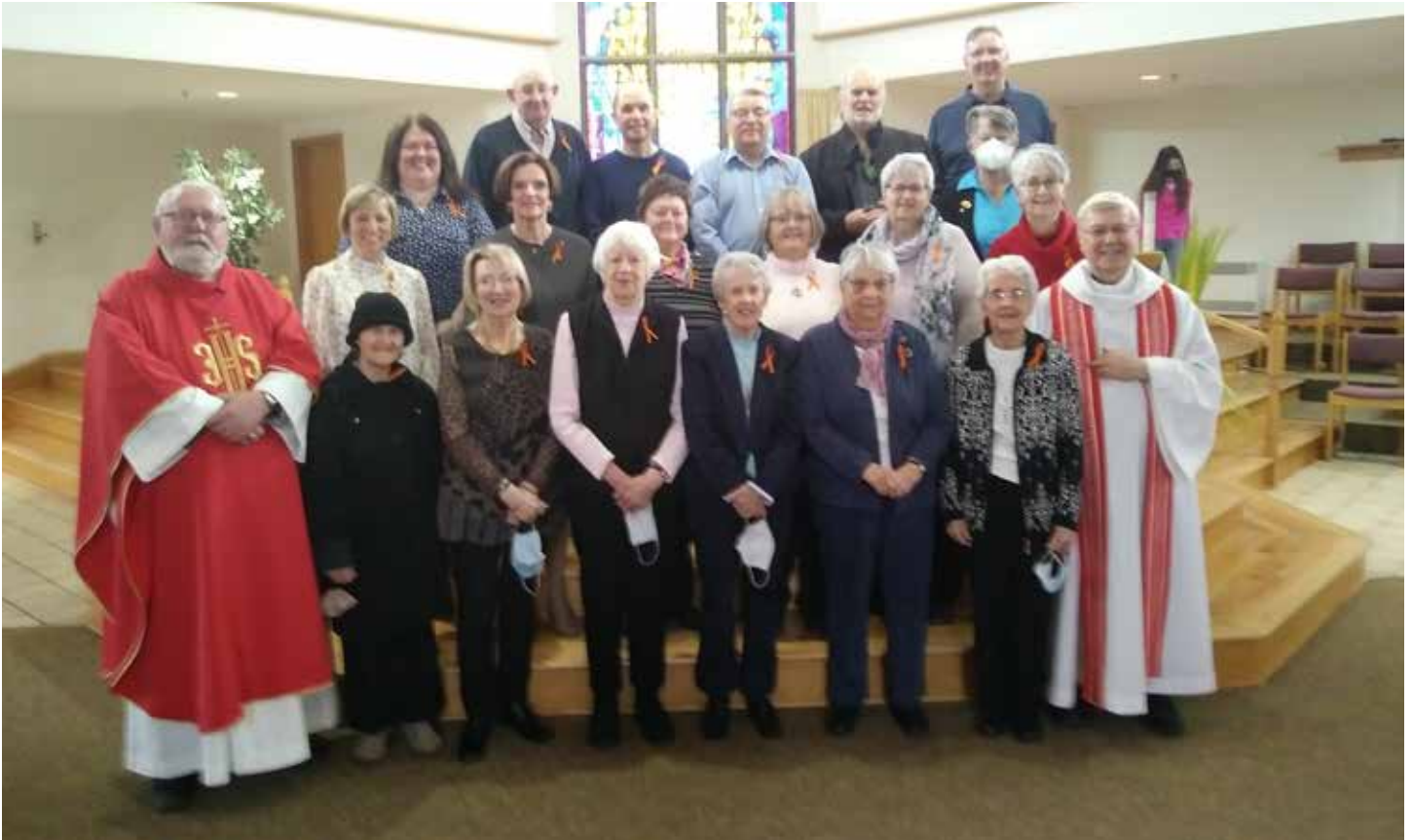
Mass For Shut Ins April 2, 2022