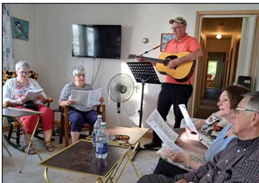
Sydney and Glace Bay Group, Keranna, 2022

“To keep a lamp burning, we have to keep putting oil in it”