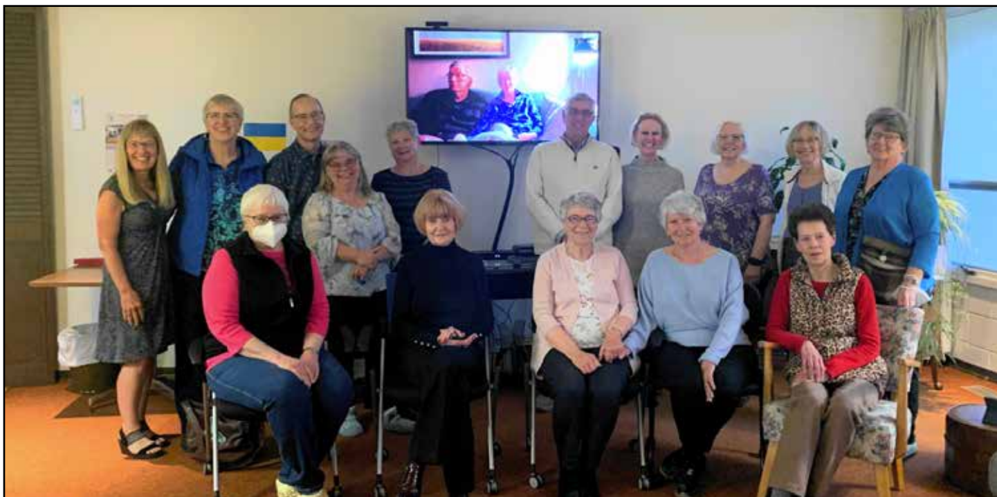
Western Associates May 19, 2022