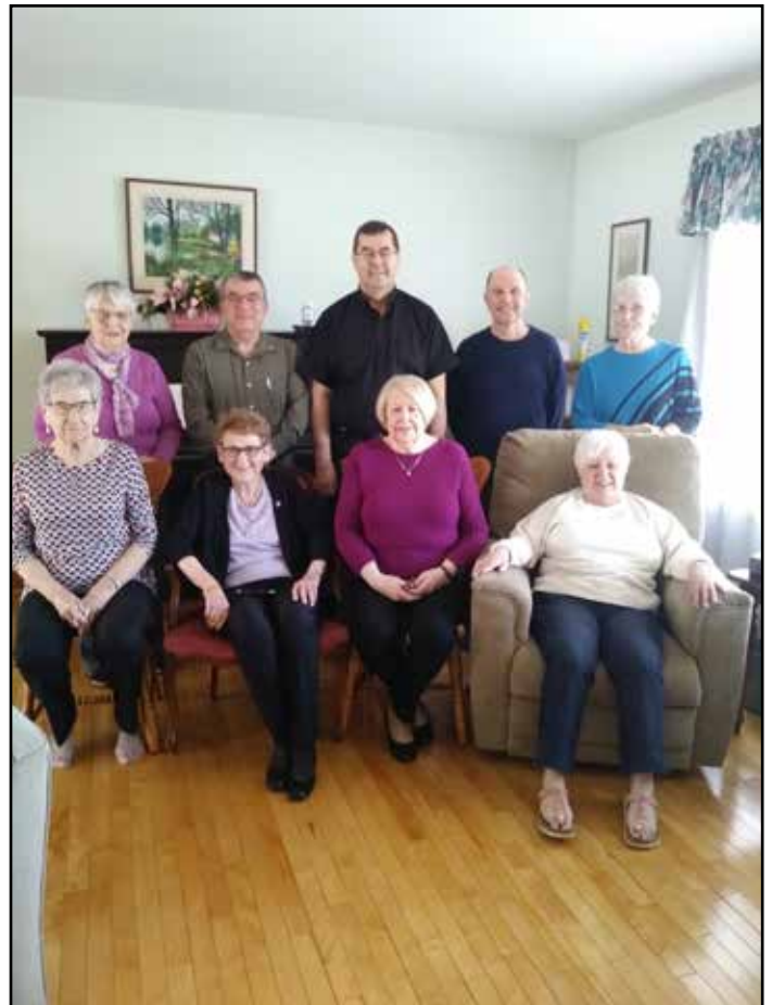
Sydney Mines Associates April 12, 2022