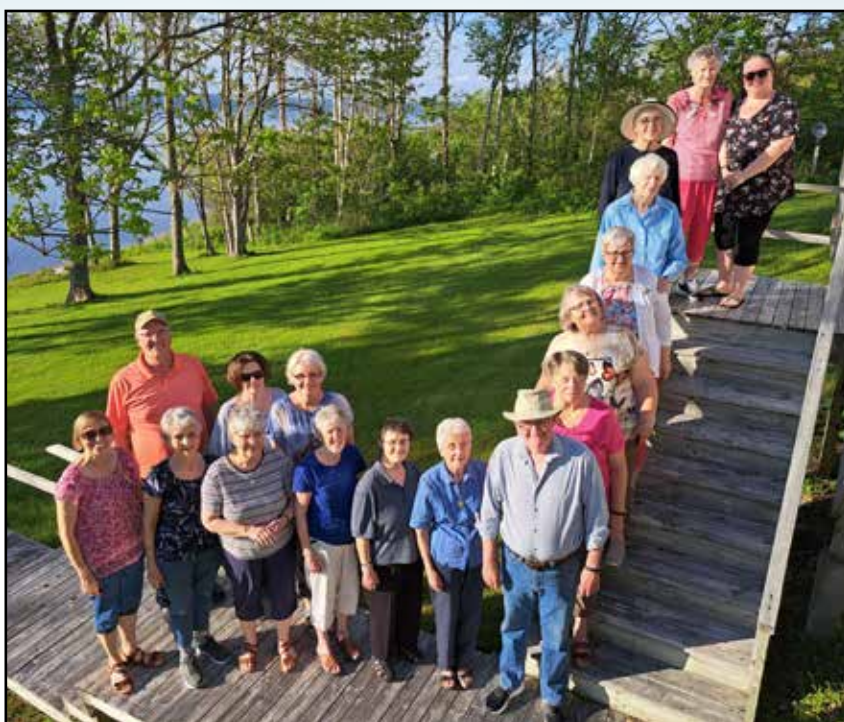
Sisters of St. Martha with Sydney/Glace Bay Associates June 2022