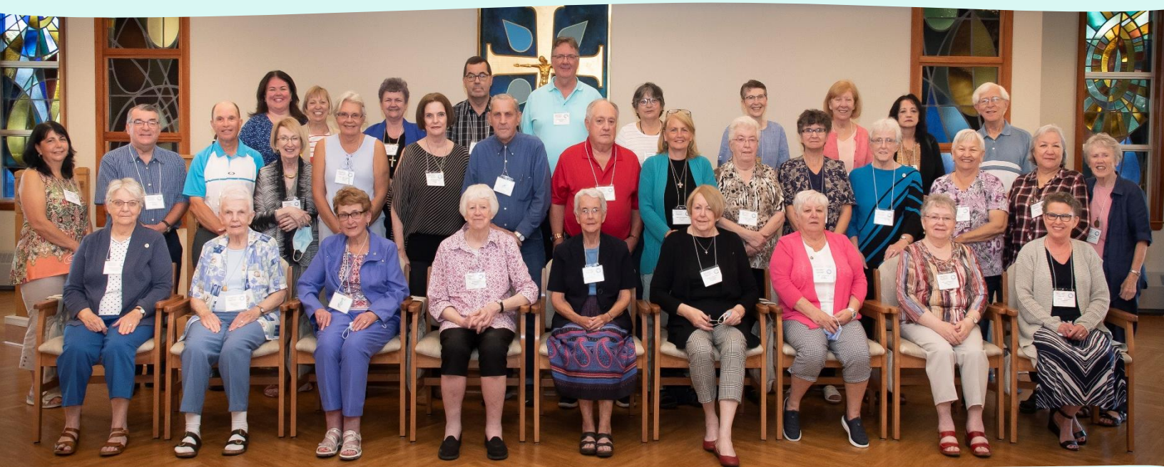
Above: East Martha Associate Retreat Day in Antigonish on September 10 th , 2022