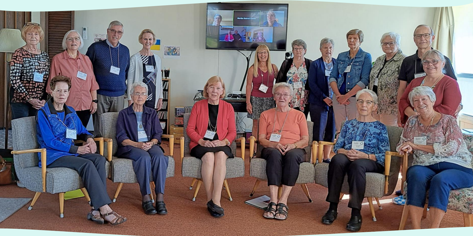
Below: West Martha Associate Retreat Day in Lethbridge on September 23-25, 2022