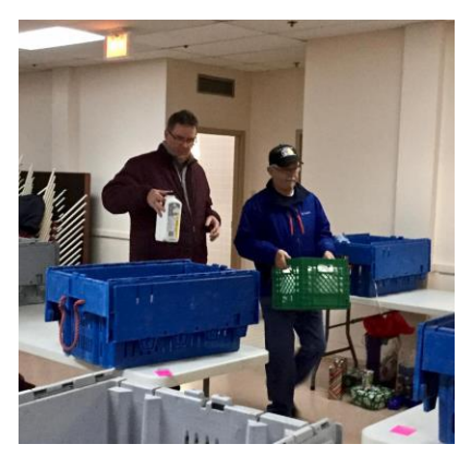
Volunteers working at Society of St. Vincent de Paul

That is why each of us can offer the gifts that we have been given to reach out to those around us and to be the face of Christ for all to