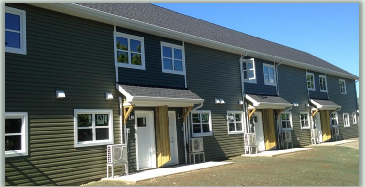
Riverside Estates, affordable housing supported by the local community

In 2018, the AAHS celebrated the official opening of Phase 2 of Riverside Estates, its multi-family complex on Hope Lane. Phase 2 includes 10 new affordable rental units—adding to the four units in Phase 1 which opened in 2017—and a Community Room. Phase 3 is now being planned for 10 new units.