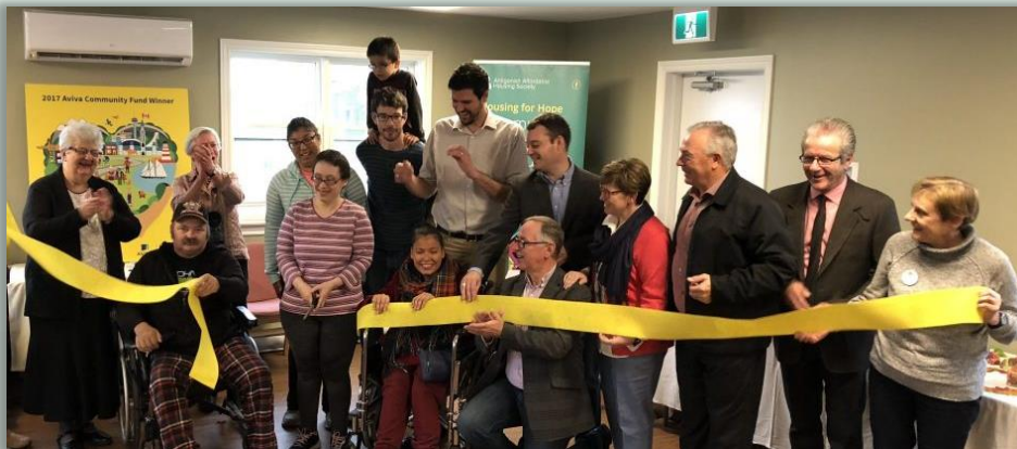
Phase 2 Open House