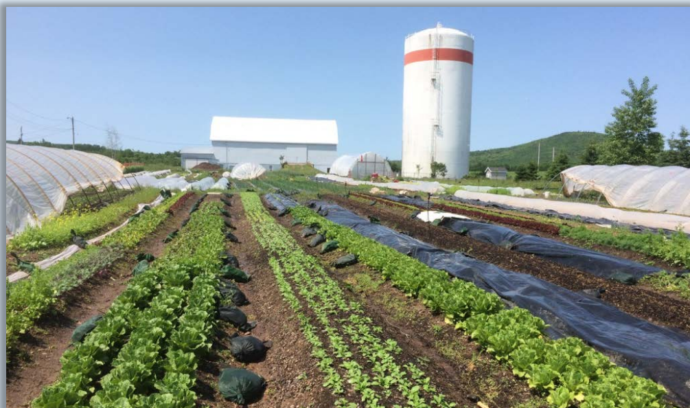
Martha New Growers fields at Bethany Grounds